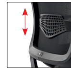
Supporto lombare regolabile in altezza Height adjustable lumbar support